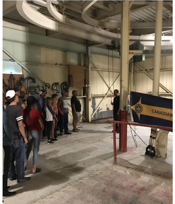
Public tour underway at CFS Alsask site.

There are many opportunities for members to get involved in the activities of the museum. If you are interested in volunteering at the Alsask site or in other activities please send an e-mail to: info@civildefence.ca