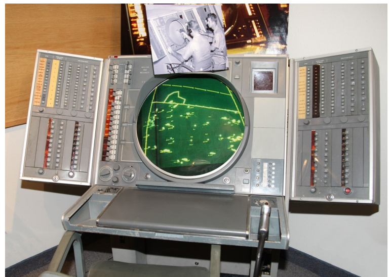
SAGE Computer Console.

G ot a suggestion for our newsletter name? We'd love to hear it. Send us an email with your suggestion at info@civildefence.ca and you could win a CCDMA prize package!